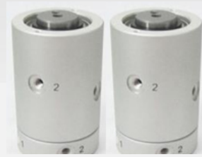
RU-LT series Rotary